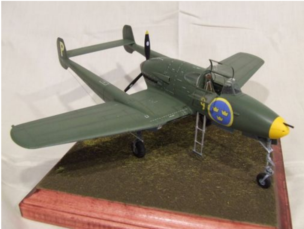
The Swedish Bikini Team Approves Pilot Replica's J-21 !!

strut fork. Care must be taken here to support the model in the correct attitude while gluing the wheel to the fork. Compounding the problem, Pilot Replicas has molded their wheels with a flat “weighted” spot on the bottom that demands careful orientation when cementing the wheel in place. To facilitate this effort I built a jig from Lego blocks and did the fine height adjustment with baseball card “shims” slid underneath the blocks. After the CA glue cured things were fine.